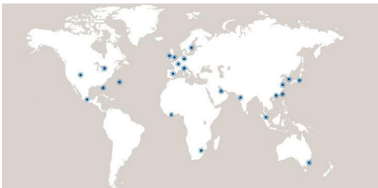
Life & Health reinsurance: offices worldwide

In our Life & Health reinsurance business group we are a global player. A key asset is our work force of approx. 1,200 employees, many of whom are located at our international locations and have the knowledge, judgement and authority to make swift decisions. Added to this, digital connectivity has accelerated our processes, ensuring our expertise and learnings are now seamlessly exportable between markets.