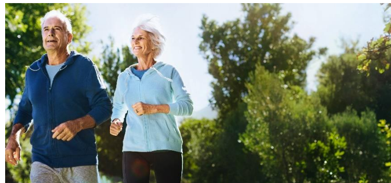
Increased prosperity, healthier lifestyles, better education, together with improved diagnostics and medical treatment, have all led to longer and better lives, which is excellent news for us all.

This is an area where we are a world leader and have an unmatched knowledge base. Our decades of experience in this market, with its roots as the first reinsurer in the UK underwritten annuities market, help us to support you with tailored products.