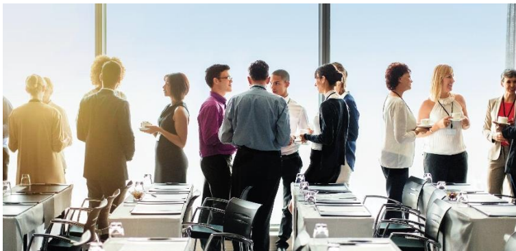
Our regional professionals in our Life & Health offices know your culture, law and business framework.

Like you, we welcome these challenges and like you, we work hard to develop these markets sustainably and profitably so we can help you meet the increasing demand for traditional plans that your customers need the world over.